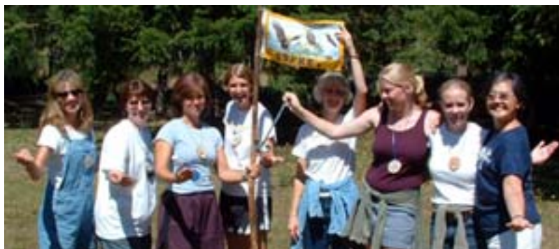
2005 SEED participants.

We visited the school of every teacher to brainstorm specific activities that could be undertaken at that school. This gave us all a mental image of the promise and limitations of the physical setting within which each teacher worked that greatly enhanced our ability to help the teachers plan their school-